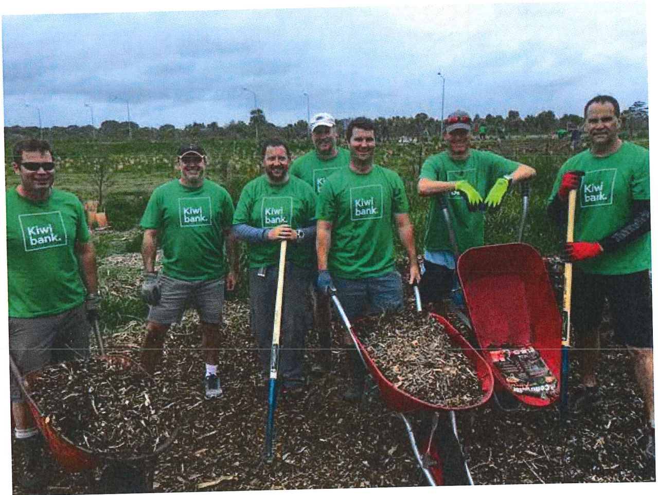
Kiwibank Volunteers, working hard in the red zone at Avon-Otakaro network earlier this year, arranged via Volunteering Canterbury's Employee Volunteering service