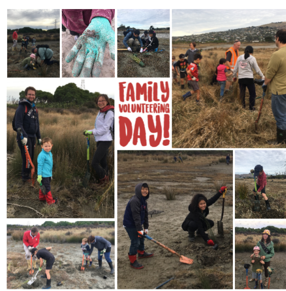
Family Volunteering event at Charlesworth Reserve