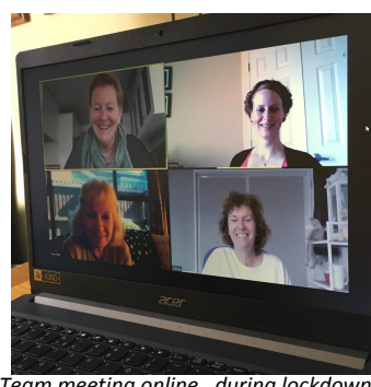
Team meeting online, during lockdown

I want to acknowledge the commitment and hard work of this new Board which only came together as the lockdown began. In spite of the restrictions imposed by the lockdown, the group adopted the mantra 'reconnect, redefine, rebuild', and has worked hard to support our staff, create a new strategic plan, support new projects, and together with the staff, build the strong, skilled and connected team that currently drives Volunteering Canterbury.