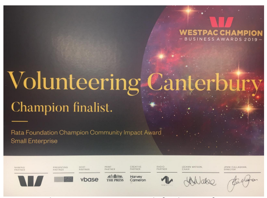
Westpac Champion Business Awards finalist certificate

It is impressive to see the increasing connections being made by Volcan within the Christchurch community and beyond. The Outreach programme, the Student Expos, the Governance Bites series of workshops, the Tautoko network, Volunteer Awards, Group Volunteering programme, etc all contribute to our high profile and solid reputation.