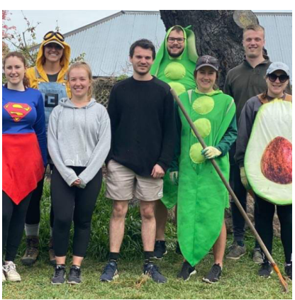
Group volunteering team from Ernst Young

Our core services continue to be in demand, with our on-line recruitment and referral service being the most well-known and well-utilised. In the past year we recruited 786 volunteers on behalf of our 288-member organisations. These organisations cover the breadth of the community sector in this area, something which offers a wide range of options for those seeking a volunteer role.