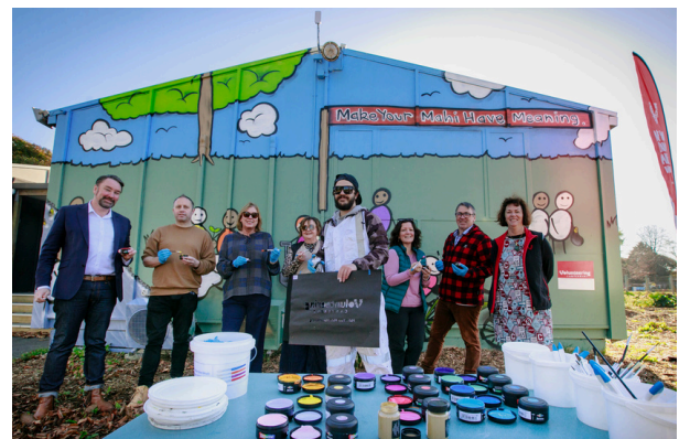
Living Wall Mural, Climate Action Campus