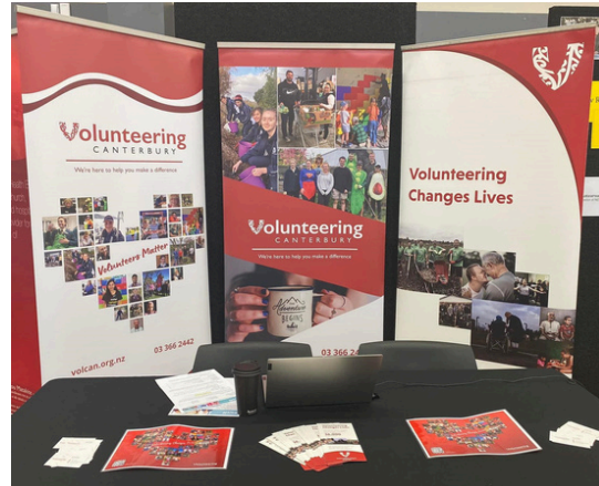
A Volunteering Canterbury public display