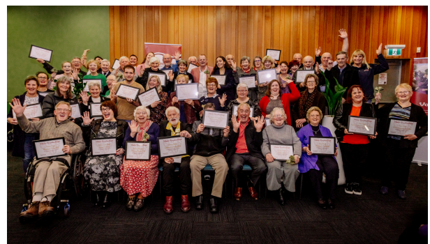
2024 Volunteer Recognition Award recipients

Recognition of volunteers continues to be a huge event for the Volunteering Canterbury team particularly during National Volunteer Week in June. This year, with the presentation of 52 awards, we acknowledged that sadly we had outgrown the amazing facility which we have utilised for many years at the Civic Offices and a new site will be identified for the 2025 Awards event.