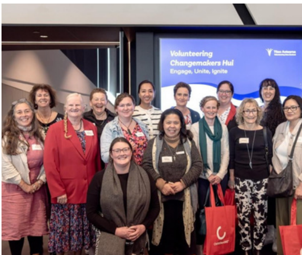
VNZ Changemakers Hui, Sept 2024

As well as our continued commitment to the Volunteer Centre Network Aotearoa, we were fortunate to support the 2024 Volunteering New Zealand Changemakers Hui held in Ōtautahi, an opportunity for local volunteer managers to immerse themselves in a day of learning and sharing with others from around the country. We were also delighted to identify 20 local volunteer leaders to attend the Hui at no charge, thanks to funding made available by Rātā Foundation.