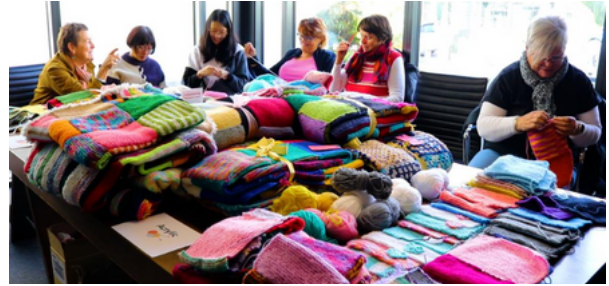
knit for Purpose, June 2024

Our 'Knit for Purpose' micro-volunteering project continued for another year, and once more people knitted at work, home and in libraries and residential facilities to produce beautiful peggy squares made from gifted wool. These were then transformed into a total of 34 blankets, and donated to community organisations across Waitaha.