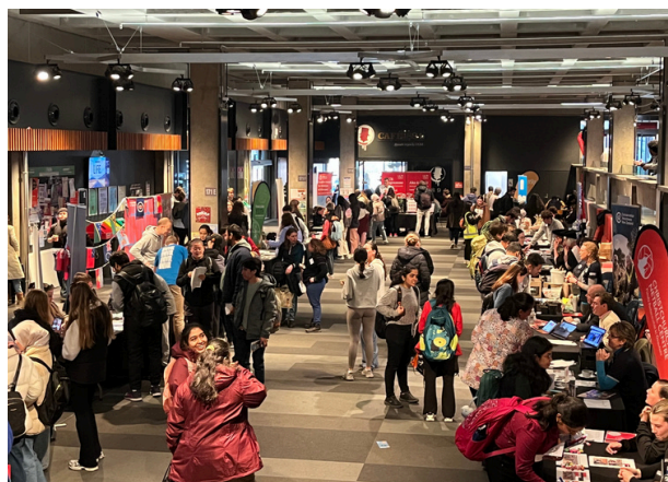
Student Volunteer Expo, Aug 2024

This year has been another dynamic one with continued growth in support for our member organisations with around 450 participants at over 49 events, specifically aimed at providing information and professional development opportunities for volunteer leaders. Member organisation numbers have remained steady, averaging 262 across the year, and together supporting over 383,000 Cantabrians through the gifting of some 1.2m hours.