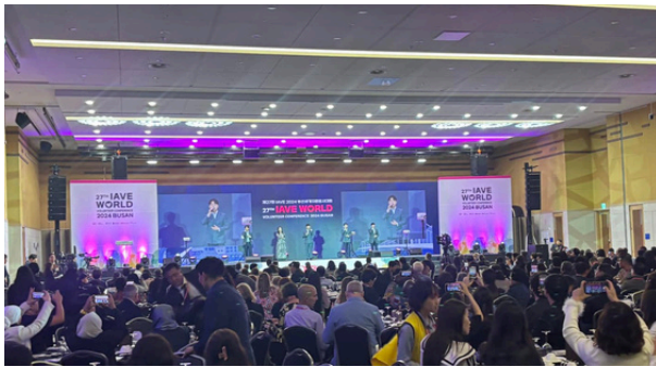
27th IAVE World Conference, Oct 2024

Our attendance at the 27 th IAVE (International Association for Volunteer Effort) World Conference in Pusan, South Korea, presented opportunities for us to share and learn about global volunteering trends and initiatives. This provided insight into what is happening in other regions of the world and also offered timely reminders of the uniqueness of volunteering across Aotearoa, where a relatively small population makes a huge impact, with an estimated contribution (based on the minimum wage of $23.15 per hour) of some $4 billion nationally (of which nearly $30 million takes place here in Waitaha).