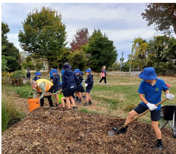
Loburn School students at Riverlution Hub

Our Group Volunteering Programme facilitated opportunities for over 1700 people to participate across 142 one-off community projects. While the groups involved were largely from local businesses, there continues to be solid support from those working with young people across primary, secondary and tertiary institutions. We are grateful to the community organisations which host these groups and ensure a worthwhile volunteer experience for the visiting teams.