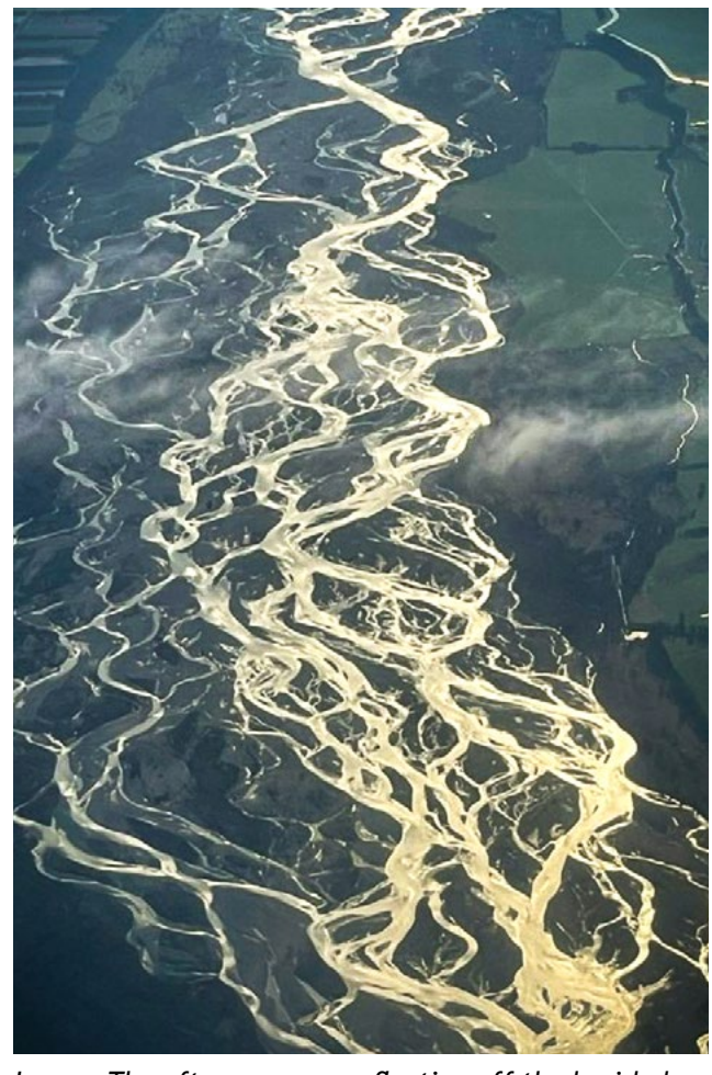
Image: The afternoon sun reflecting off the braided Rakaia River flowing out of Lake Coleridge, captured on a flight south to Queenstown.

Then the magic ingredient to really see new opportunities, is that you have to be willing to also let directions shift, like a braided river, and go where the water of new opportunities are flowing.